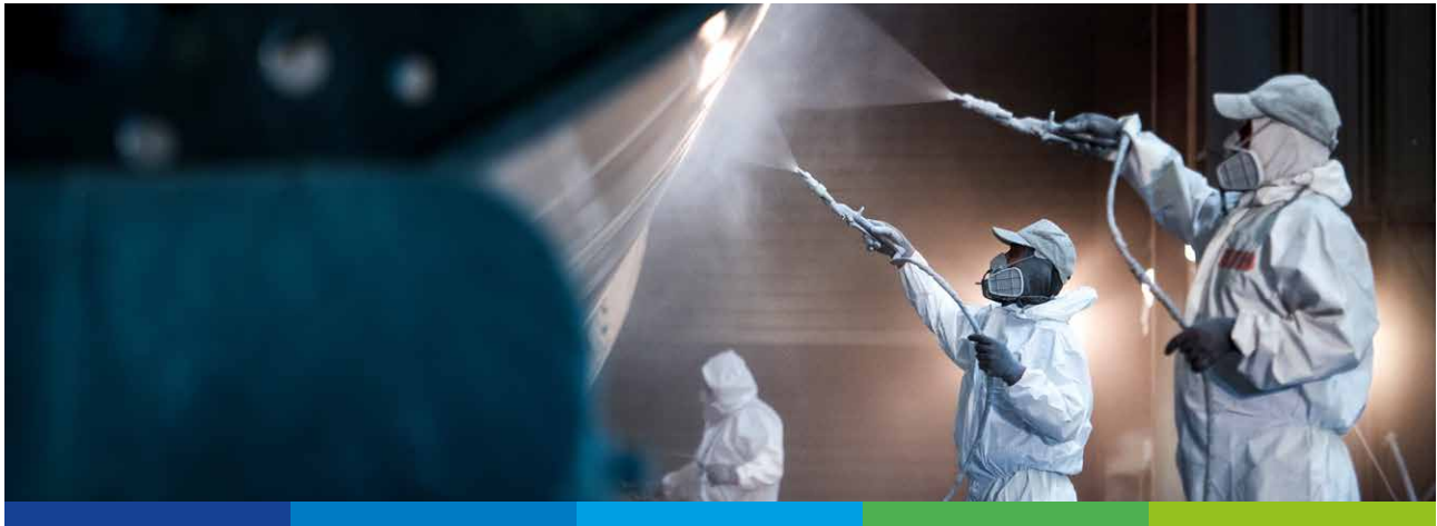
Application of surface protection on a ship's hull