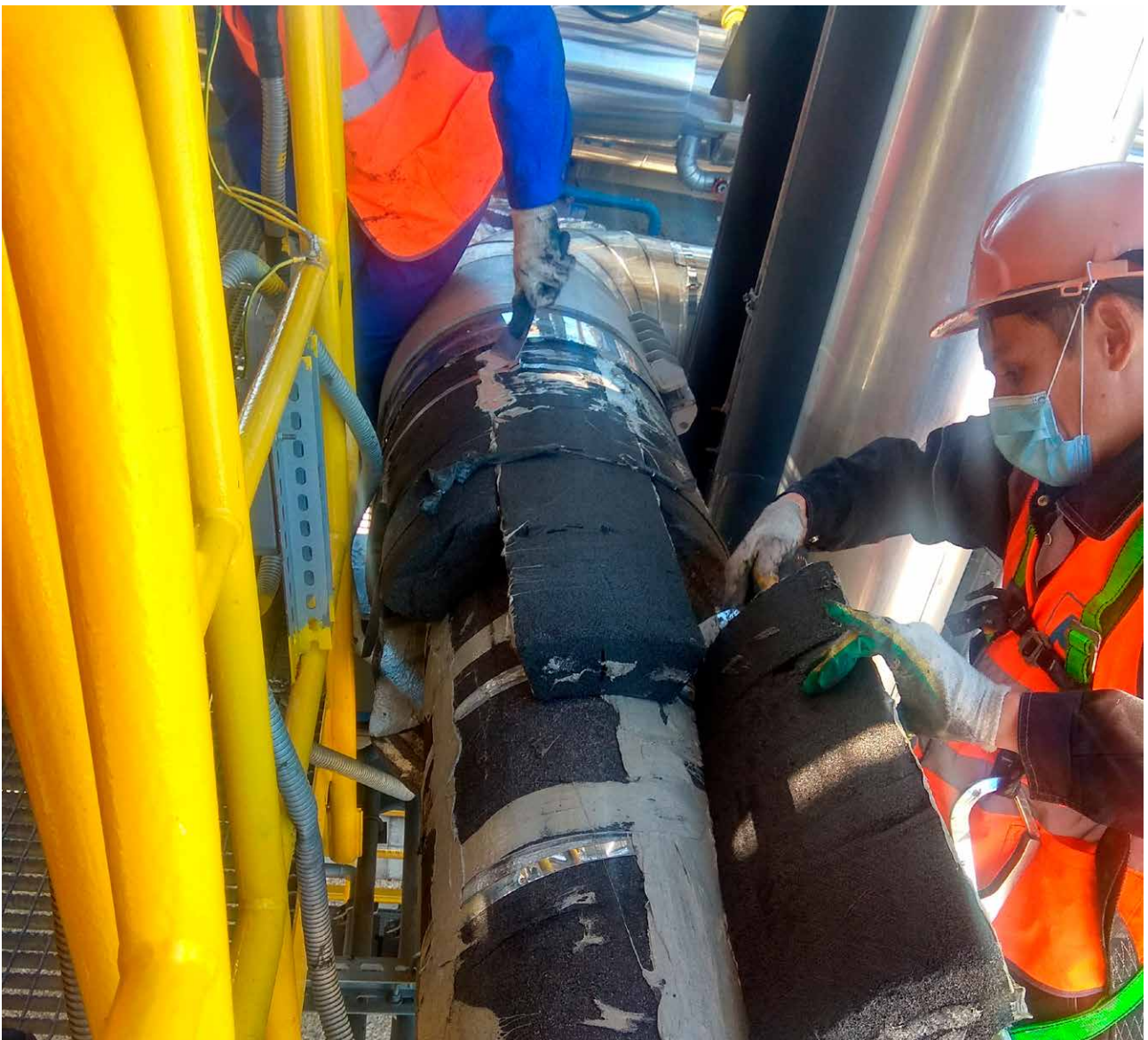
Insulation work in Russia

There are no other material changes to the Group's opportunities and risks in comparison with the 2020 financial year. We therefore refer you to the detailed notes published in the 2020 Annual Report.