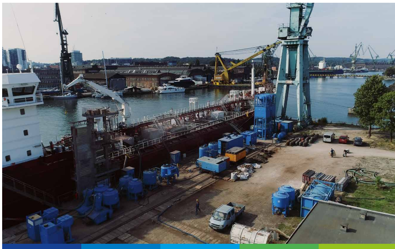
Surface protection work on a ship