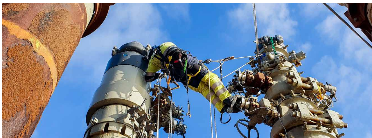
Access technology on offshore oil platform