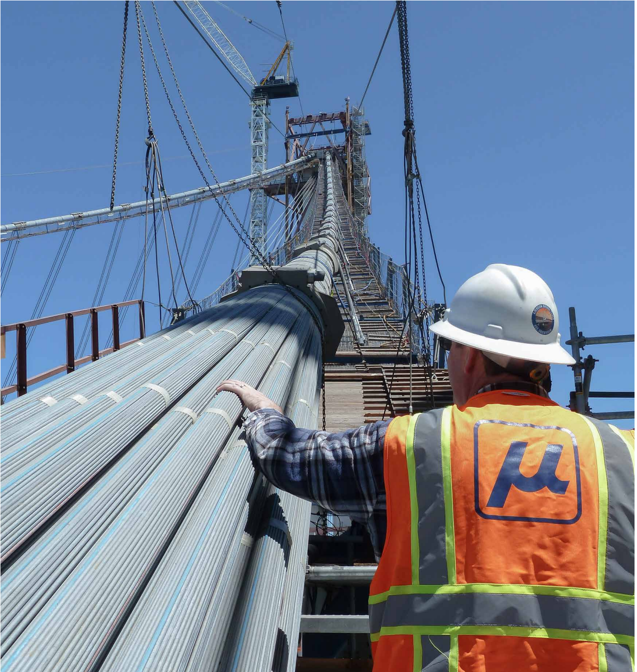
Surface protection work on a steel bridge in the US